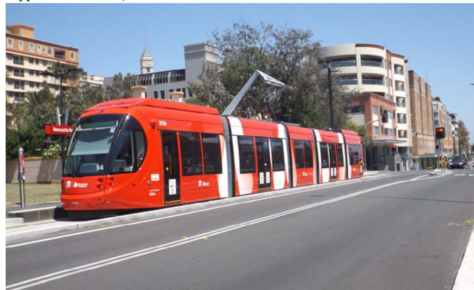
Light Rail Vehicle at Newcastle Beach Terminus being re-charged.

V acancies exist in this 5-day/4-night all-inclusive tour of gardens and galleries in Gold Coast and Sunshine Coast areas, accommodated at Caloundra Oaks Oasis, with West Beecroft Club. The tour is from Thursday, 11 July to Monday, 15 July 2019 and is priced at $1750 pp twin share (single supplement is $320). Details from Wal.