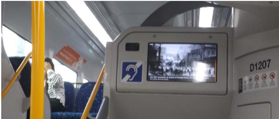
A newly constructed non streamline 38 class locomotive