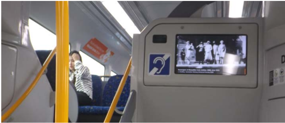
In new Waratah Train B sets—A scene at a former North Coast Line station