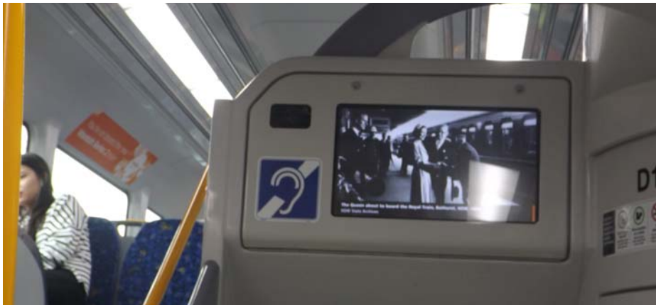
Her Majesty Queen Elizabeth II on Bathurst Station in 1954

Private and confidential for Probus use only and is not to be used for any other purpose.