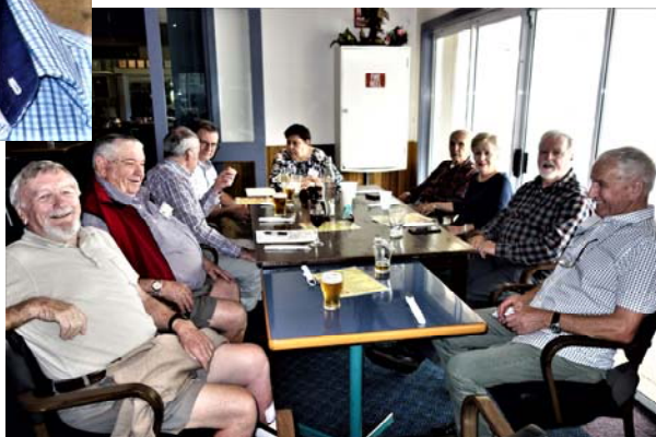
The Luncheon Group's 1 st get together

Private and confidential for Probus use only and is not to be used for any other purpose.