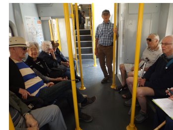
The Epping Probus Train Outing on the now closed Carlingford Line in November 2019