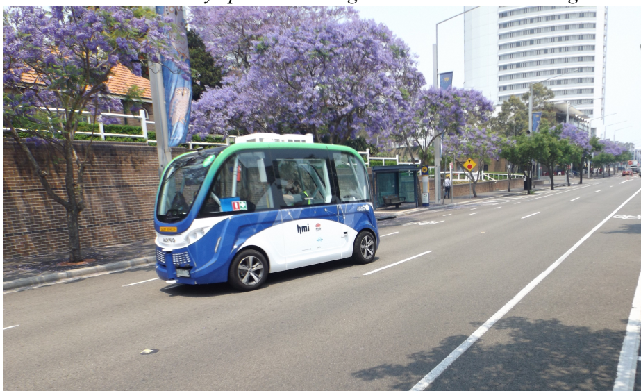
The driverless electric shuttle bus at Olympic Park

Private and confidential for Probus use only and is not to be used for any other purpose.