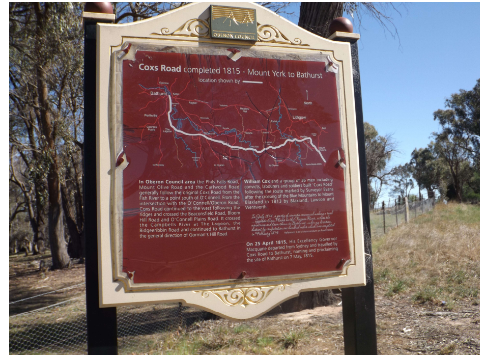
The Interpretation signage at the junction of Lowes Mount Road and Cox’s Line of Road (Carlwood Road). It provides a brief history of Cox’s Road.

Suggestions have been made in the press and elsewhere for people to do self-drive tours in NSW to support towns affected by drought and/or bushfires. This could involve 3- or 4-day trips to such locations for example as the Blue Mountains/Lithgow, Mudgee, Bathurst/Orange, Riverina, South Coast. This would take some planning do it as a group activity. If there is any interest, please speak to Wal.