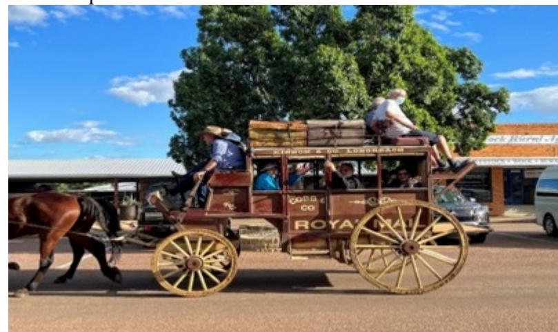
Probus members taking a coach ride in Longreach in 2022