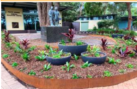
The Bruce Kingsbury Memorial Garden

Private and confidential for Probus use only and is not to be used for any other purpose.