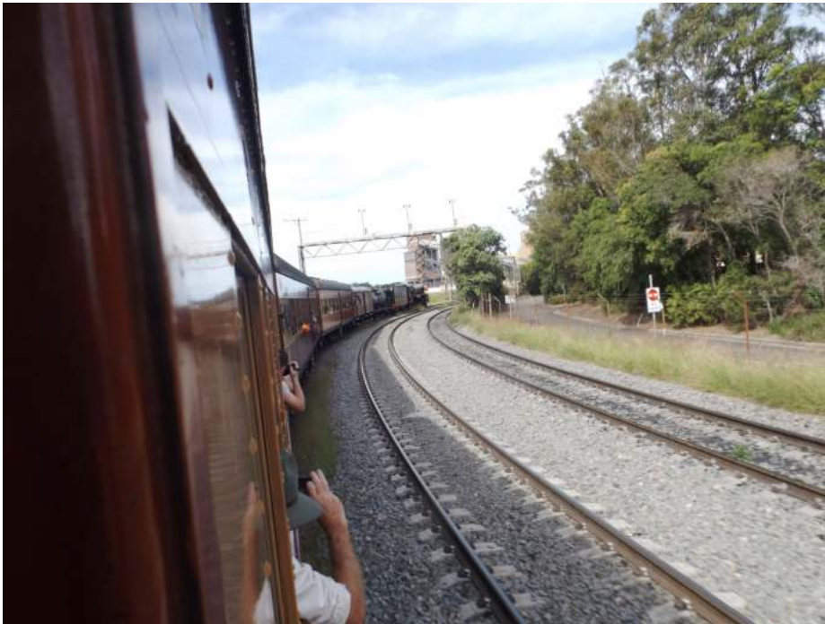
R 766 hauling its train around the balloon loop at Port Waratah

Private and confidential for Probus use only and is not to be used for any other purpose.