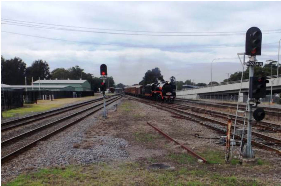
R 766 arriving back at Maitland from Port Waratah on 29 April 2023