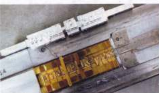
Ludlow, 1945, casts a line of display type