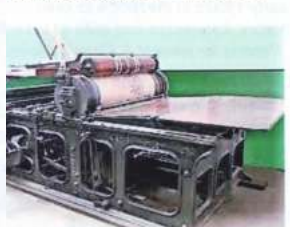
Wharfedale Cylinder Press 1880