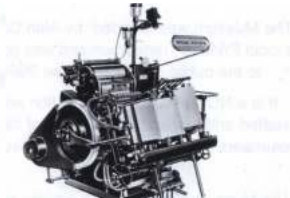
Automatic Platen Press circa 1960's