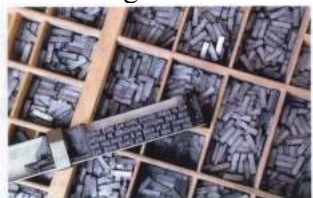
Hand setting a line of type letter by letter

On the next page are two pamphlets printed especially for our group and the Printing method used is indicated on the pamphlet.