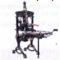
Albion Printing Press, 1864