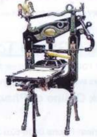
A Columbian Press, 1841