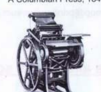
A Clamshell Platen Press 1911 Automatic Vertical Cylinder Press, circa 1940's