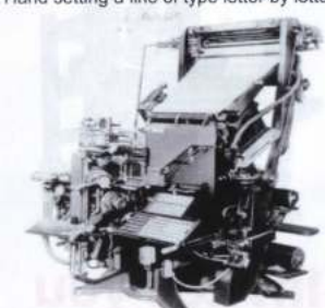
Linotype, circa 1940's, casts a line of type