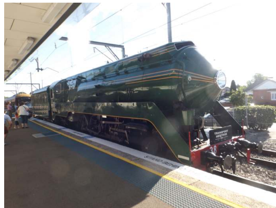
3801 at Broadmeadow on 28 April 2023